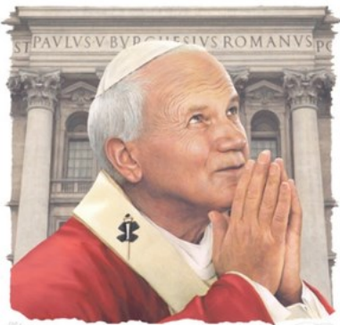
St. John Paul II, Pray for us!

Oh St. John Paul, from heaven's window, where we see you next to Mary, send God's blessing down upon us all. Amen.